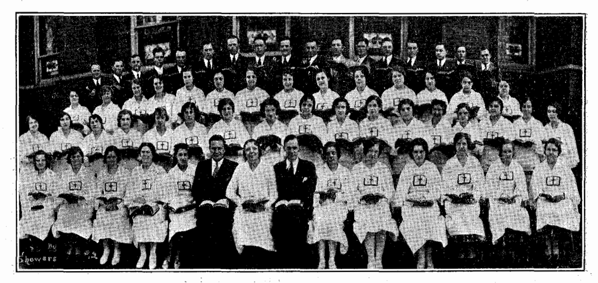
Choir of the Church of the Open Bible

In addition to the purchase price of the property, $9000 was expended for repairs and improvements, including the rebuilding of the pipe