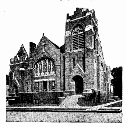
The Church of the Open Bible

Services were conducted in the former Grace Methodist church, a rented building seating 1000, but the pastors felt that it was a waste of money to continue to pay a high rental, so they tried to